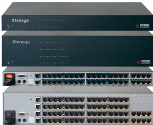
Als Beispiel abgebildet: 2 zu 32 bzw. 4 User zu 64 Rechner