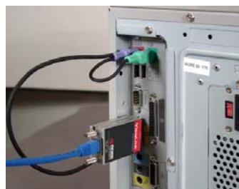
Connect the transmitter directly to a PC's Video, keyboard, and mouse ports